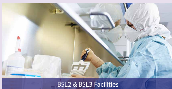
BSL2 & BSL3 Facilities