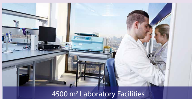
4500 m 2 Laboratory Facilities

CLINICAL TRIAL OPERATIONS SERVICES consist of preparing and designing virology sampling kits, courier transport coordination, sample tracking and tracing (guaranteeing temperature controlled supply chain and online-sample timelines), management and training of sample processing labs.