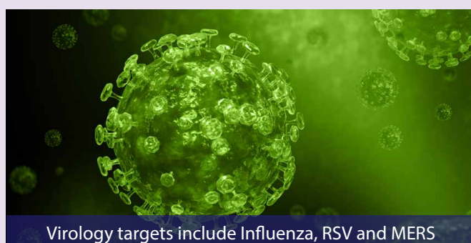
Virology targets include Influenza, RSV and MERS